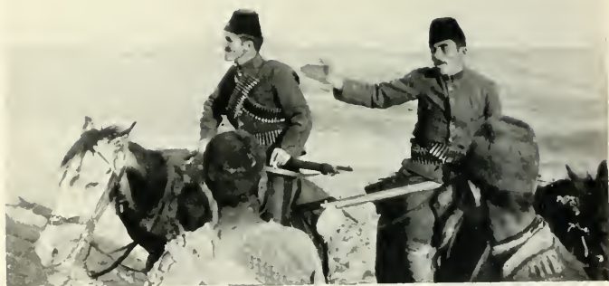
GENDARMES AND ARMENIAN PEASANTS